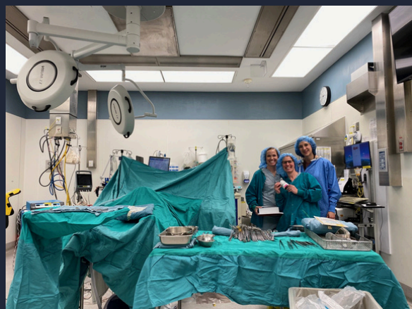
Left Photo: Misericordia OR Staff participating in the A'MHPazing Race Right Photo: Setting the scene

In preparation for May 10, we developed an Amazing Race style in-service title “A-MHP-zing Race” done April 26, 2024. This gamification in-service broke down the entire protocol into nine stations and one roadblock engaging staff in a comprehensive learning experience, combining theoretical knowledge with hands-on application. We also arranged for a Transfusion Medicine (TM) in-service on May 3, 2024 which offered a further overview of the MHP components and nursing considerations.